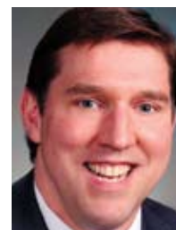
SENATOR BRIAN HATFIELD WASHINGTON