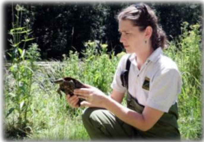
Expand Conservation Efforts