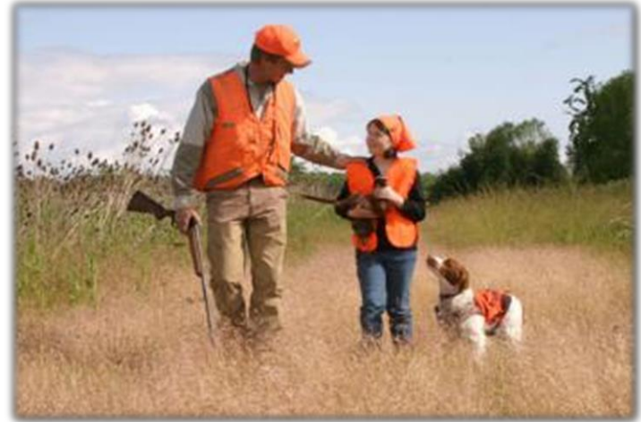
Improve Fishing and Hunting