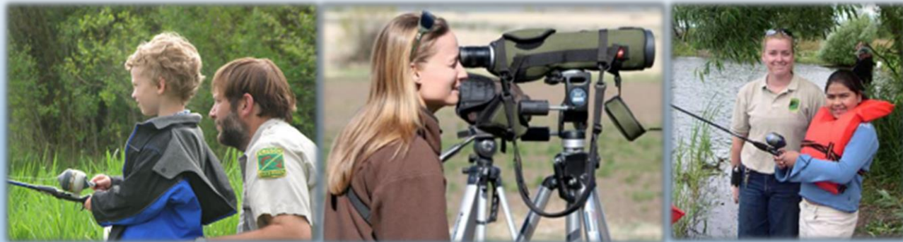
Connect Oregonians with the Outdoors